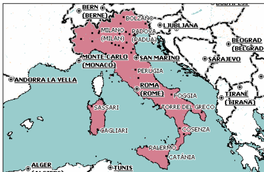
TIM's Coverage Area

The TIM network is a dual-band mobile network which provides GSM and 3G services. It supports prepaid roaming, WAP (wireless application protocol) navigation, high-speed data services, and international videophone.